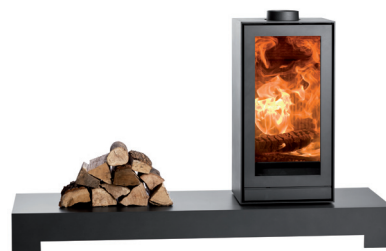
TQH 13 - Bench