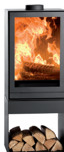
TQH 33 - Tall stand