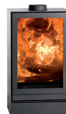
TQH 33 - Low stand